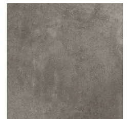
Timeless Grey 6003

An exceptional rendition of cement that showcases an array of marks, stains, and cracks in diverse shades, immersing you in the quintessential urban atmosphere.