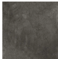
Stormy Charcoal 6005