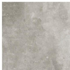
Silver Dusk 6002