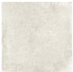
Moody white 6001