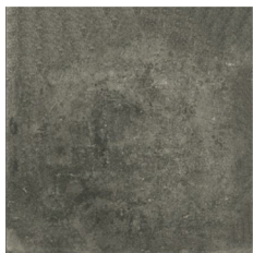
Peppercorn Ash 6004